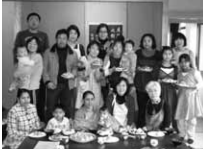
【We made sushi cake for hina matsuri (doll festival)】