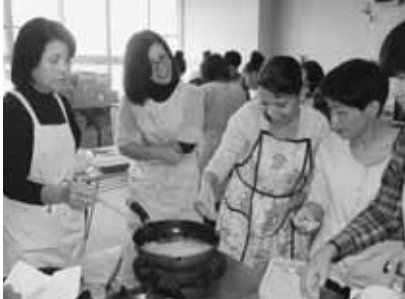
【We all made Chinese and Bangladesh food together.】

Class Location : Miki-cho Fukushi Center (next to the Miki-cho town office) Class Time : Monday, Saturday 10:00am ~ 12:00pm Class Fee : Free Contact : ☎087-891-3314 (Miki-cho Board of Education)